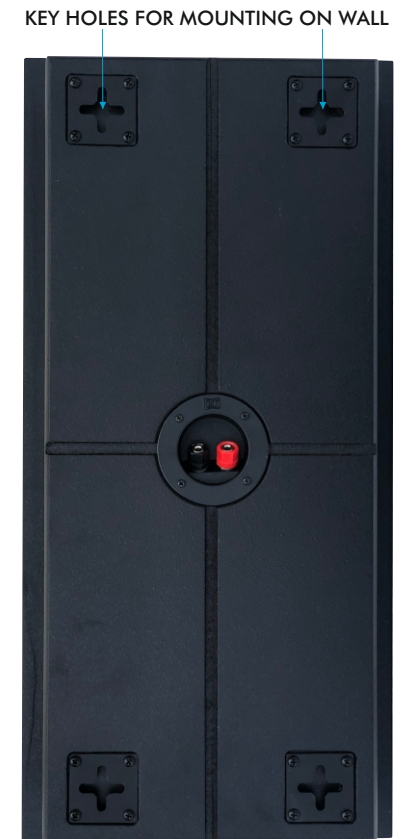
REAR VIEW OF THE SPEAKER