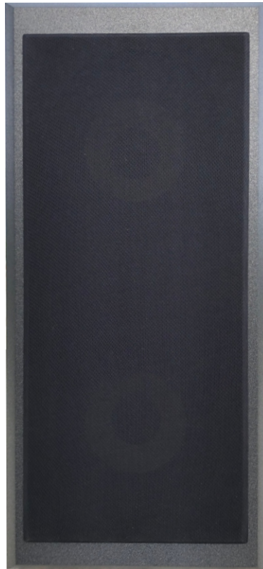
FRONT VIEW OF THE SPEAKER WITH MAGNETIC GRILL