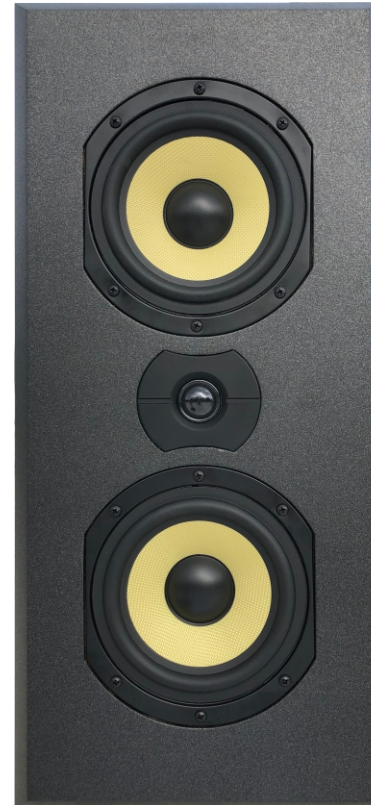
FRONT VIEW OF THE SPEAKER WITHOUT MAGNETIC GRILLE